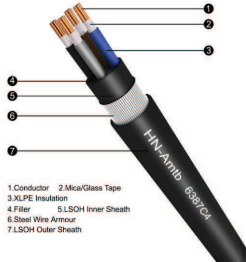
1. Conductor 2. Mica/Glass Tape 3. XLPE Insulation 4. Filler 5. LSOH Inner Sheath 6. Steel Wire Armour 7. LSOH Outer Sheath